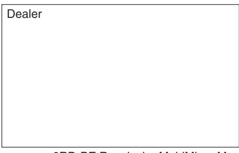
* High Temp Non LCD model ** LCD model